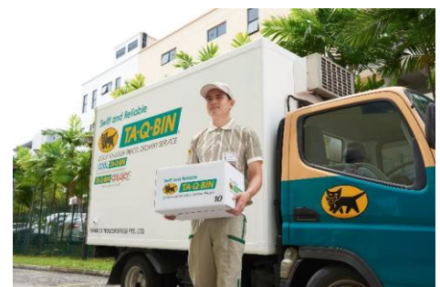
Yamato Transport Singapore

Yamato Transport Singapore launched its TA-Q-BIN service in 2010 and offers refrigerated parcel delivery service within Singapore using refrigerated/frozen system-equipped vehicles, as in Japan. We will perform the chilled transport both within Japan and to Singapore using Yamato Transport's proprietary airfreight cooler container. By harnessing the Yamato Group network, we will deliver fresh product which will stay fresh from Japanese businesses to Singaporean consumers.